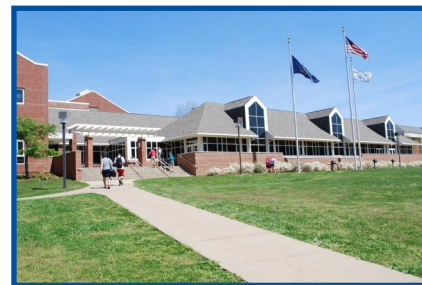
The Hall of Fame will be located in Chambers Hall.