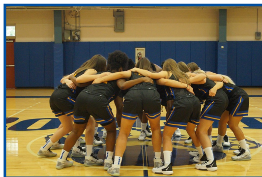
Women's basketball is poised for a memorable season.