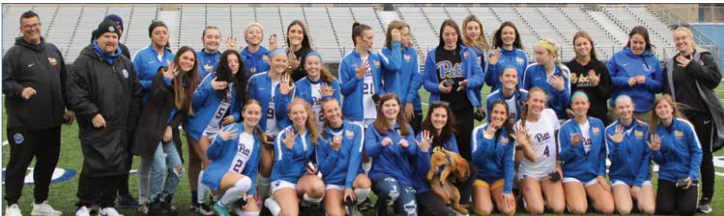
The women's soccer team show off their 2022 AMCC Post-Season Championship Tournament rings for a photo taken before their match against Alfred State.

The women's soccer team received their 2022 AMCC Post-Season Championship rings in a brief ceremony prior to their match against conference opponent Alfred State. Friends and family in attendance were able to enjoy this special moment with their players. The Bobcats went on to post a 7-3 win against the Pioneers.